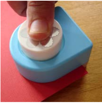
Punch the flower out of paper