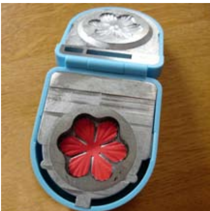
Open the punch