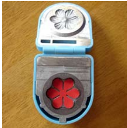
In the designated area