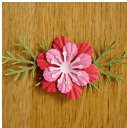
The result of all floral punches combined