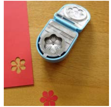
Place the embossing punch upside down and open it