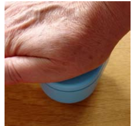
Close the punch and turn it while pressing down on it