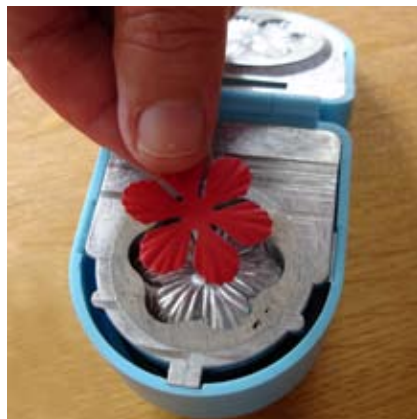
Remove the flower from the punch