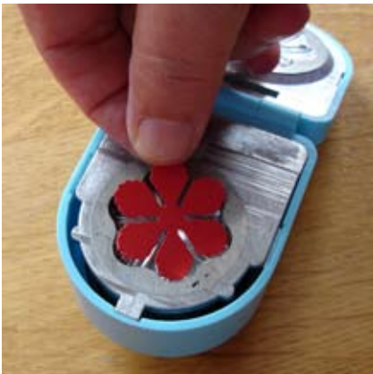
Place the punched-out flower inside